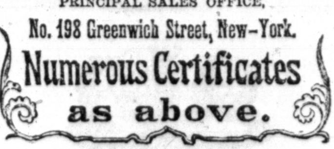
AVERY BROWN & CO., Halifax Agents. Jan. 7.