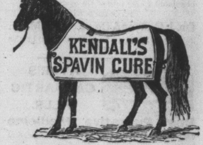
KENDALL'S SPAVIN CURE

The Mail for the UNITED KINGDOM per Canadian Packet, via Rimouski, will close every FRIDAY at 4.30 o'clock, p.m. H. W. BLACKADAR, Postmaster. Post Office, Halifax, N.S. 23rd June, 1883 July 4. 1 yr.