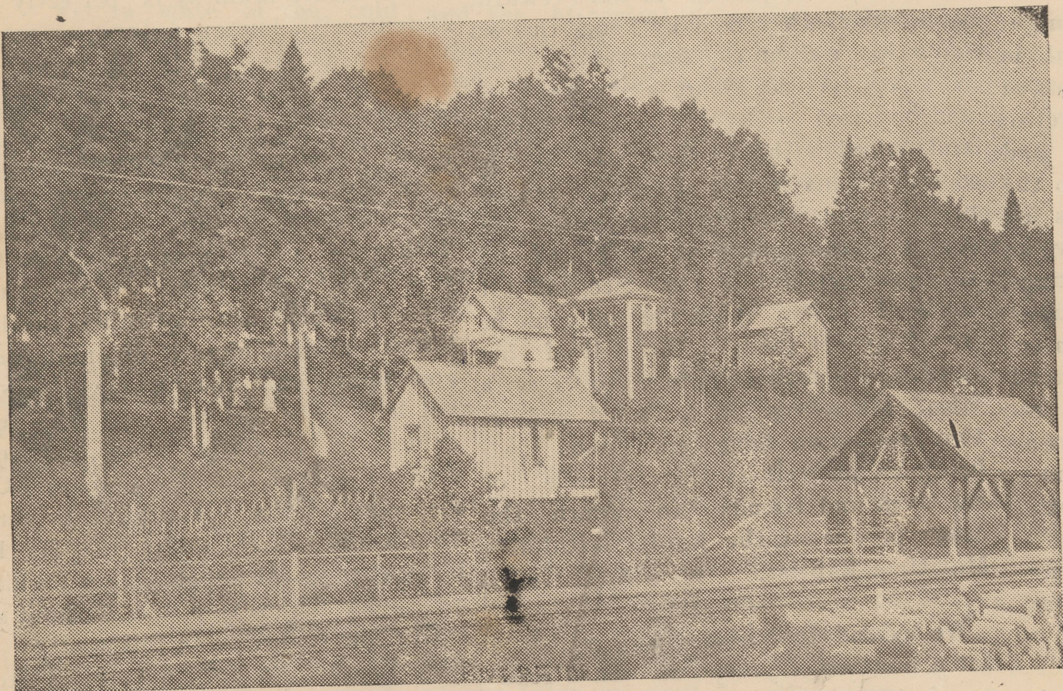
RIVERSIDE CAMP GROUND

All ticket agents from Caribou to Millinocket, will sell return tickets at One Fare from August 9th to 22nd. all passenger trains stop at Camp Ground during the meetings. Fare from Houlton and return $1.10.