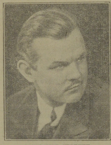
LAWRENCE TIBBETT. famous baritone, who will make his second appearance of the season in the Voice of Firestone program over CFCF, Montreal, and CRCT, Toronto, on Monday, December 18, at 9.30 p.m., A.S.T.

WEEI—Boston—508.2—590k. 6.30 p.m.—Ralston Program. 6.45 p.m.—"The Wizard of Oz." 7.00 p.m.—The Evening Tattler. 7.30 p.m.—News. 7.40 p.m.—Twilight Hour. 8.00 p.m.—Molle Program. 8.15 p.m.—After Dinner Revue. 8.30 p.m.—Lum and Abner. 8.45 p.m.—The Goldbergs. 9.00 p.m.—Soconyland Sketches. 9.30 p.m.—Voice of Experience. 10.00 p.m.—A and P Program. 10.30 p.m.—California Packing Co. 11.00 p.m.—Carnation Milk Program. 11.30 p.m.—"K-7," secret service story. 12.05 a.m.—News. 12.15 a.m.—The King's Jesters. 12.30 a.m.—Hotel Statler Orchestra. 1.00 a.m.—Penn Hotel Orchestra. 1.30 a.m.—Terrace Gardens' Orchestra.