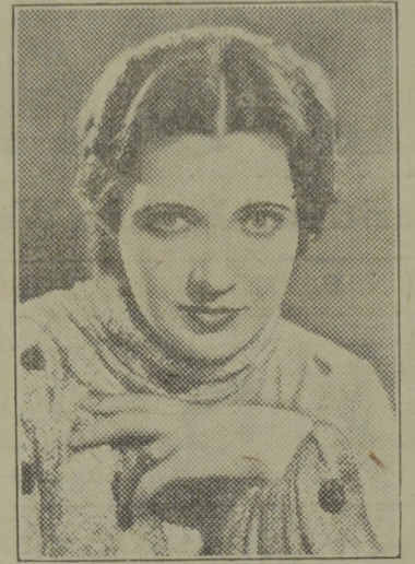
KAY FRANCIS, screen star, who will be heard over an NBC-WEAF network on Wednesday, December 20, at 10.00 p.m. A.S.T., as guest of the Ipana Troubadours.