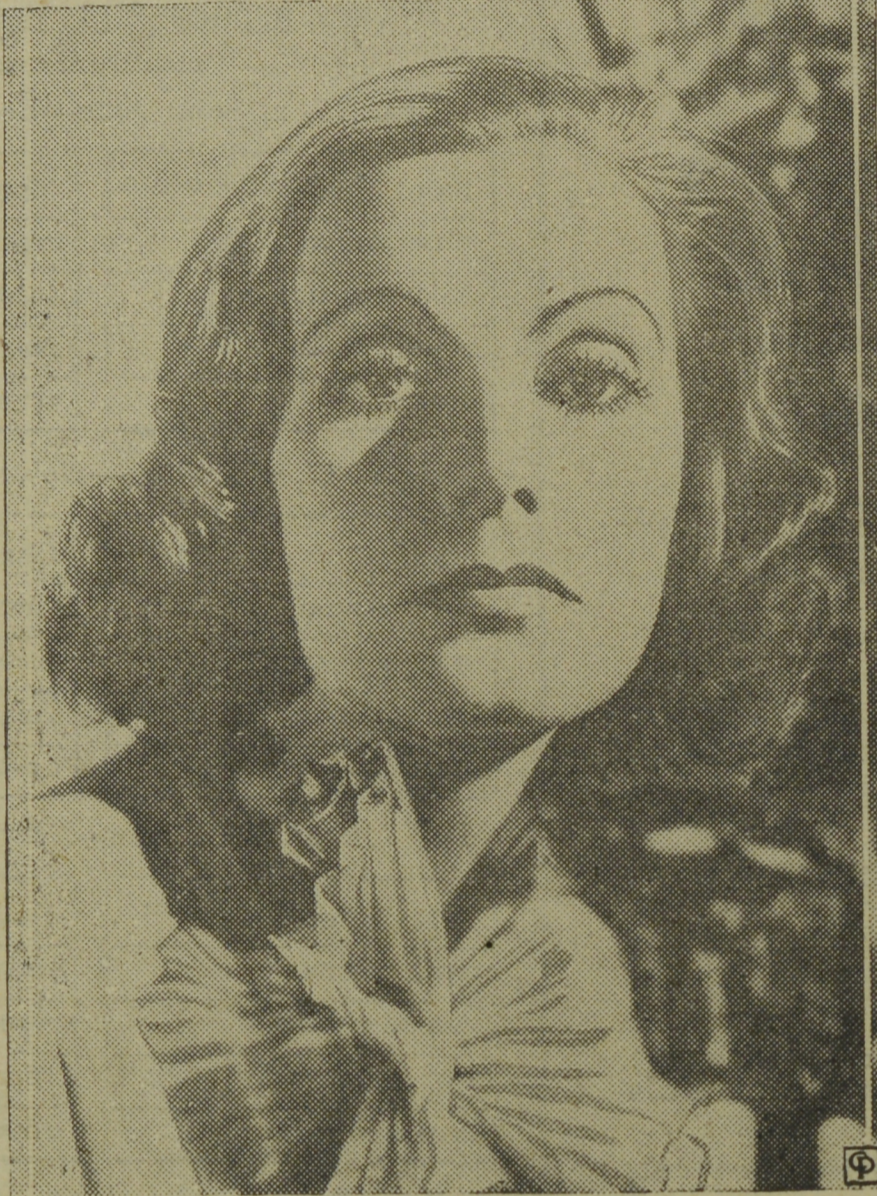
Studio portraits of GRETA GARBO are not common, and this new one is an uncommonly intimate glimpse of the famous film star, who started her career in her native Stockholm, Sweden, as an apprentice in a barber shop.

this with assurance that their greetings will not be delivered before the time desired.