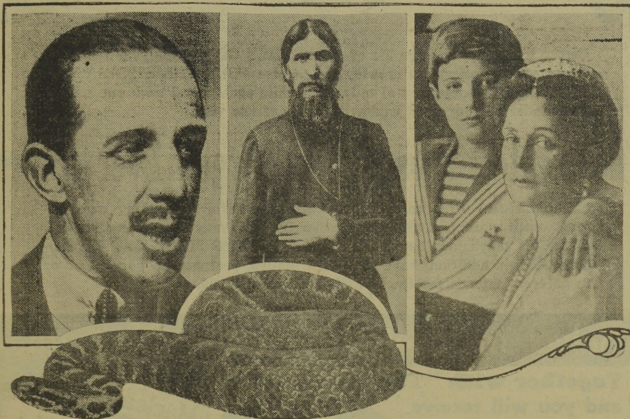
The deadly venom of snakes will be used in the battle against a deadly disease. The "curse of kings" has wrecked dynasties. Right, is the former Czarevitch, son of the last Russian Czar, with his mother. Centre, GREGORY RASPUTIN, the monk, whose claim to heal-

British Researchers Find Way to Stop Bleeding Immediately. Claimed Discovery Will Save Many Lives.