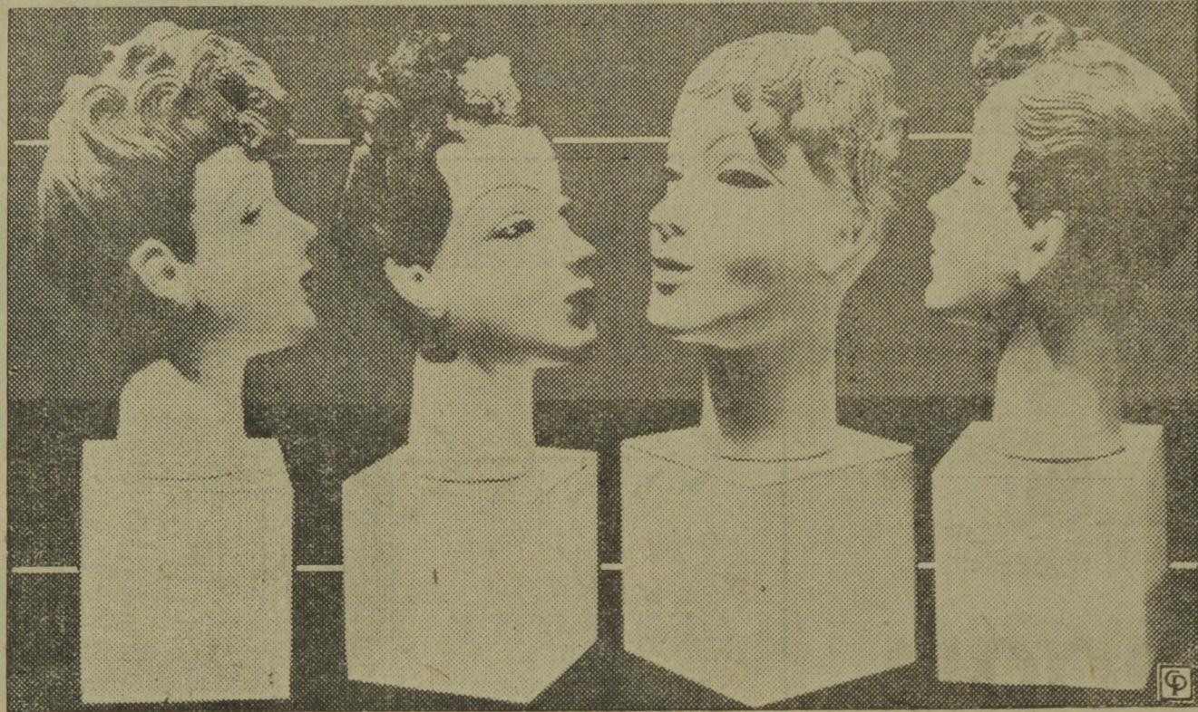
SOME OF THE NEW SEASON'S COIFFURES

RINGLETS ARE NOW POSED HIGH ON FOREHEAD IN BANGS OR SWIRLS, BOBS SHORTER BEHIND OR LONG ENOUGH TO PIN UP.