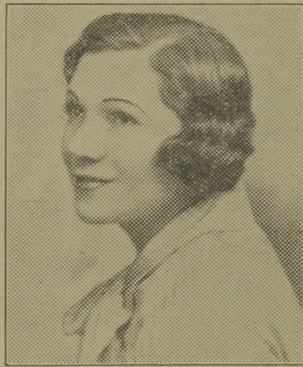
VIVIENNE SEGAL, singing star of the Waltz Time broadcasts over NBC.