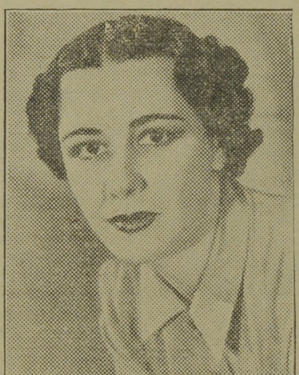
GLADYS SWARHOUT, prima donna of the Firestone Garden concerts heard over an NBC-WEAF network every Monday at 8.30 p.m., A.S.T.