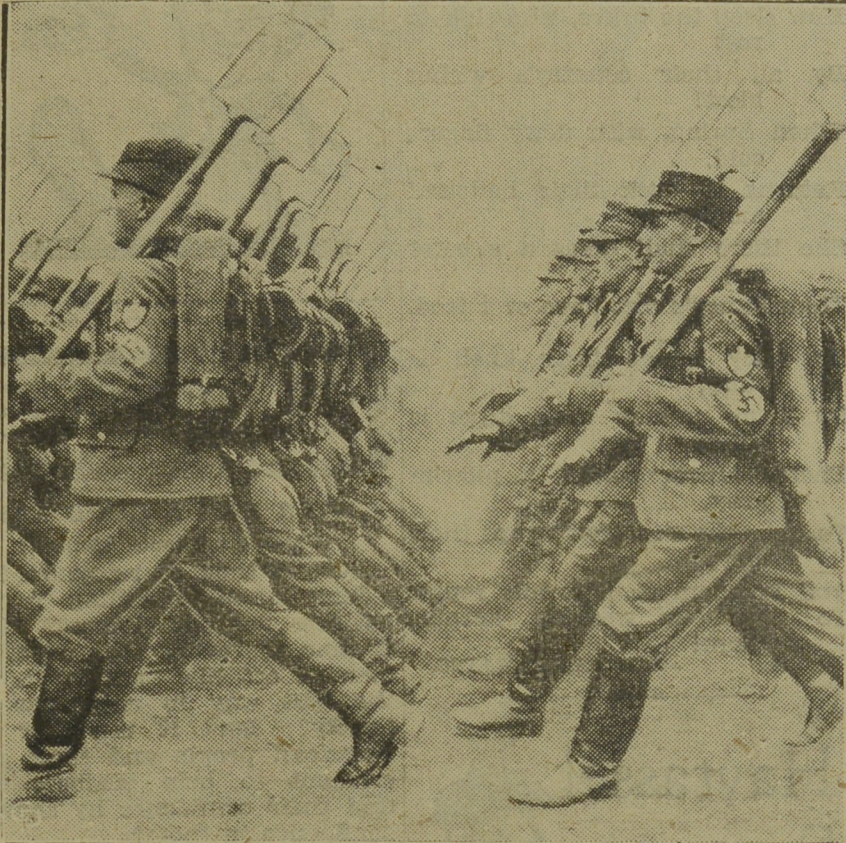
A striking picture showing the German desire to drill, even when they are forced to use shovels until they get guns. Following a trip through Germany, William Randolph Hearst wrote: "We may or may not like Hitler, but if you are in Germany the fact is obvious, indeed unavoidable, that the vast majority of the German people do like him and do support him aggressively and emotionally." Mr. Hearst previously had written: "There are apparently only two conditions in Europe. One is a state of war, and the other is a state of preparation for the next war."