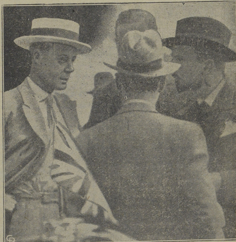
The PRINCE OF WALES, seen arriving there, was an eager listener as the British delegates sought desperately in the League of Nations' council at Geneva, Switzerland, to head off Italy's apparent preparation for an African war of conquest.