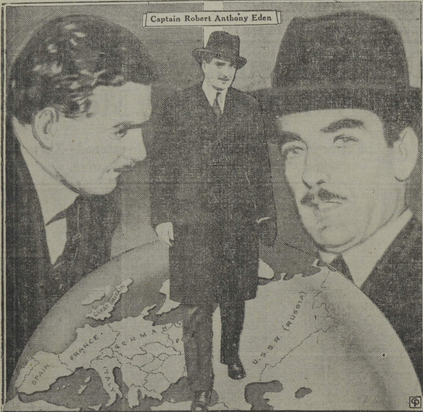
Captain Robert Anthony Eden

CAPTAIN ROBERT ANTHONY EDEN, THE BRITISH PRIVY SEAL, BECOMES KNOWN AS THE "PEACEMAKER OF THE CONTINENT" AT THE EARLY AGE OF THIRTY-EIGHT