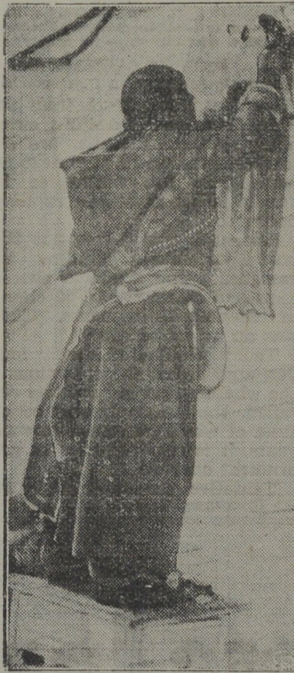
An Eskimo woman on Baffin Island hanging sealskin to dry before sewing it into boots. One of the type who will be moved to Canadian possessions further north, where food and fur is more accessible and where they can occupy land claimed by Canada.

Only the younger and healthier natives are picked for the northward trek, and the proposition is carefully explained to them, so that they are free to take advantage of it or reject it. Work is given them at the police and fur posts farther north, which is an inducement, as the more southern posts have too large a community to give everyone work. At the northern posts there are many chores to be done, for the men guiding winter patrols and food hunting, for the women sewing and cooking. There are no posts