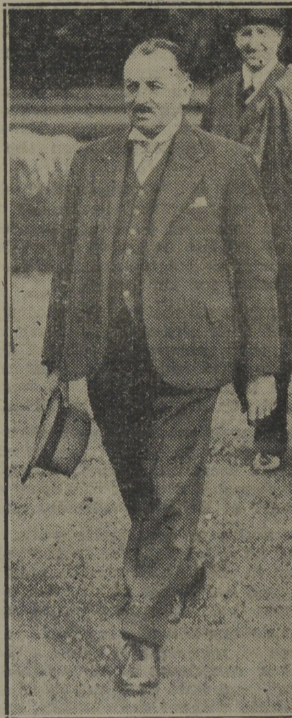
One of the important changes in the British cabinet was the appointment of ERNEST BROWN to the post of Minister of Labor. Mr. Brown is shown above.