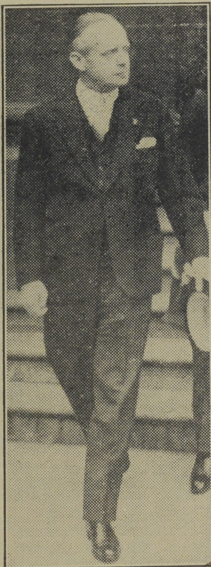
Here we see HERR VON RIBBENTROP, leader of the German naval delegation to London, leaving the British Foreign Office after one of the sessions of the first Anglo-German naval talks since the war.