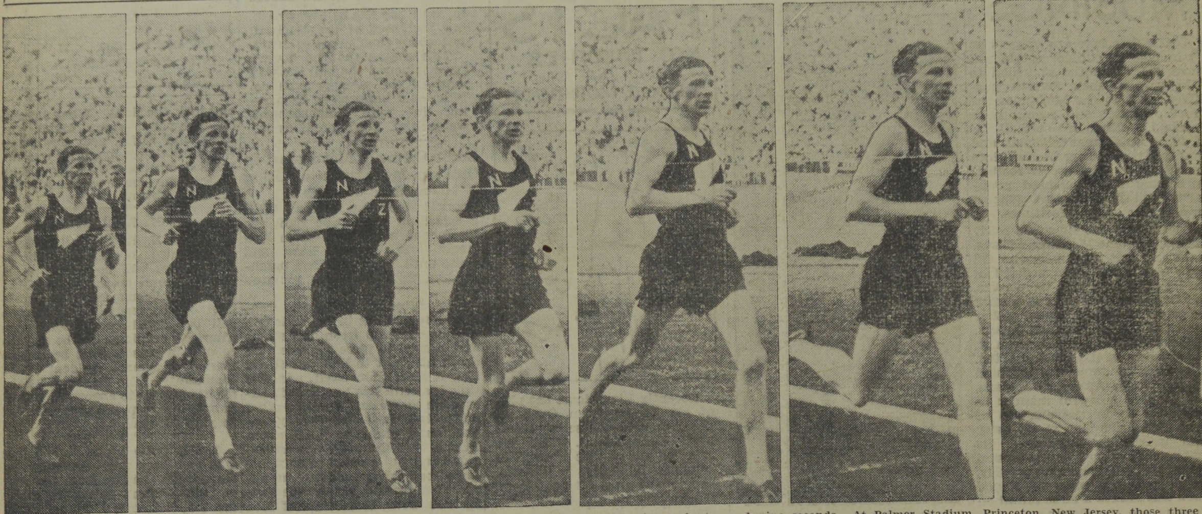
In all the world there are only three humans who have run the recorded mile in faster time than four minutes and nine seconds. At Palmer Stadium, Princeton, New Jersey, those three speedsters were brought together to race against themselves and time in an invitation one-mile contest. They are Glen Cunningham of Kansas, Bill Bonthron of Princeton and Jack Lovelock of Oxford University and New Zealand. Lovelock won that classic race, eased up, though the world record was not endangered. Here we see the closing strides of the invader as he dashed for the tape, finishing with plenty to spare, while Cunningham faded badly and Bonthron finished second. The sequence from Left to Right shows the kick of Lovelock's step, the long, powerful stride and perfect co-ordination of body and arms as he swings toward the finishing mark.