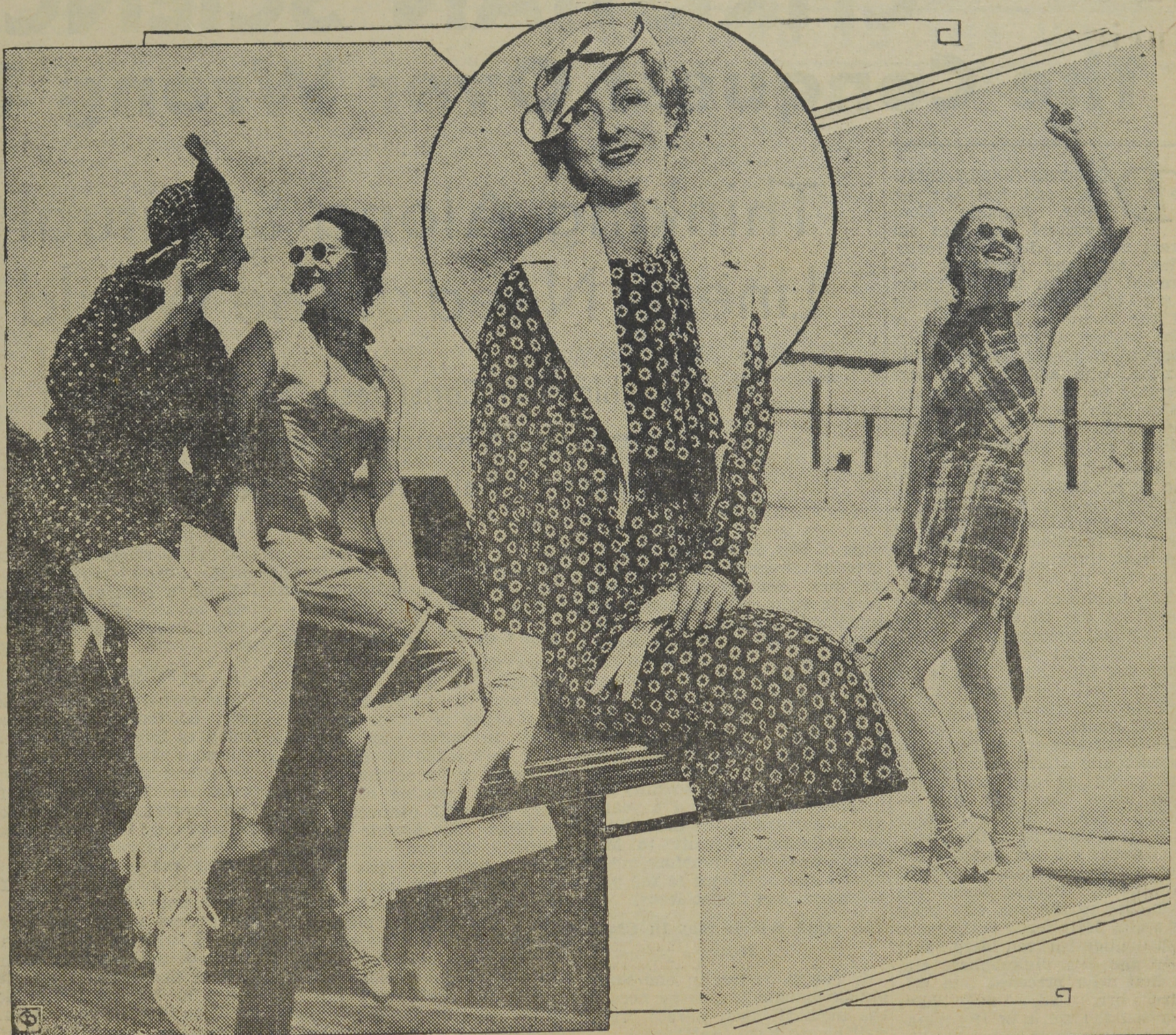
Centre is your travelling suit in black silk crepe in conventionalized daisy dot design, white pique revers; left, white shantung pajamas with dotted crepe jacket; next, tailored trousers and halter top of emerald green irepey shantung. Right, red and blue plaid taffeta swimming suit.

The other suit consists of tailored trousers and a halter top of emerald green crepey silk shan-