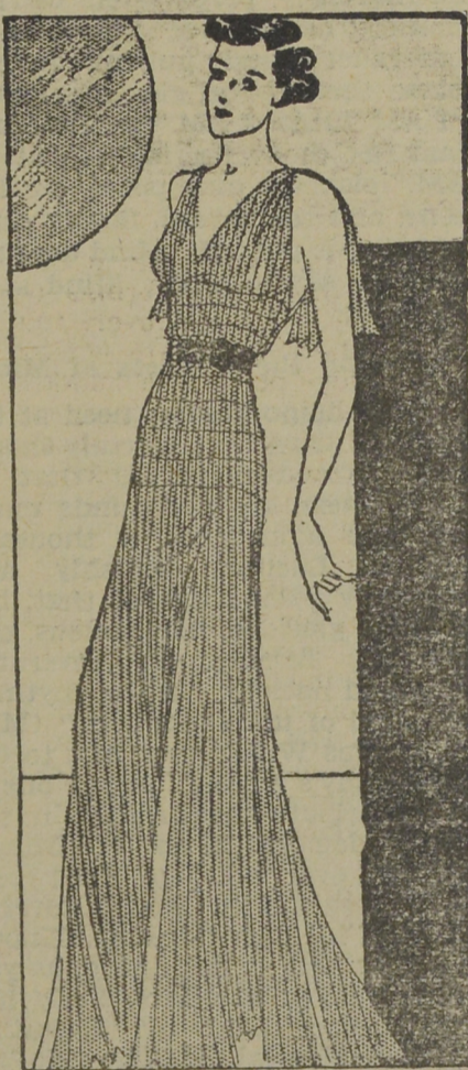
A charming DINNER GOWN for mid-summer wear is the pleated chiffon shown above. It is in the lovely new lilac shade which, trimmed with a belt of fuchsia suede provides an interesting color combination.

Today we illustrate a charming dinner gown in the lovely new lilac shade. It is in a finely pleated chiffon and, combined with a belt of fuchsia suede, provides an interesting color combination. This gown is simplicity itself, sweeping to the floor in graceful lines, and the draped effect is further carried out in the neckline which is caught at the shoulders with two wings of the pleated chiffon floating down the