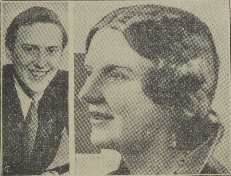
Reports from Amsterdam say that the betrothal of CROWN PRINCESS JULIANA, of Holland, daughter of Queen Wilhelmina, to PRINCE CHARLES, of Sweden (both above), will soon be announced.