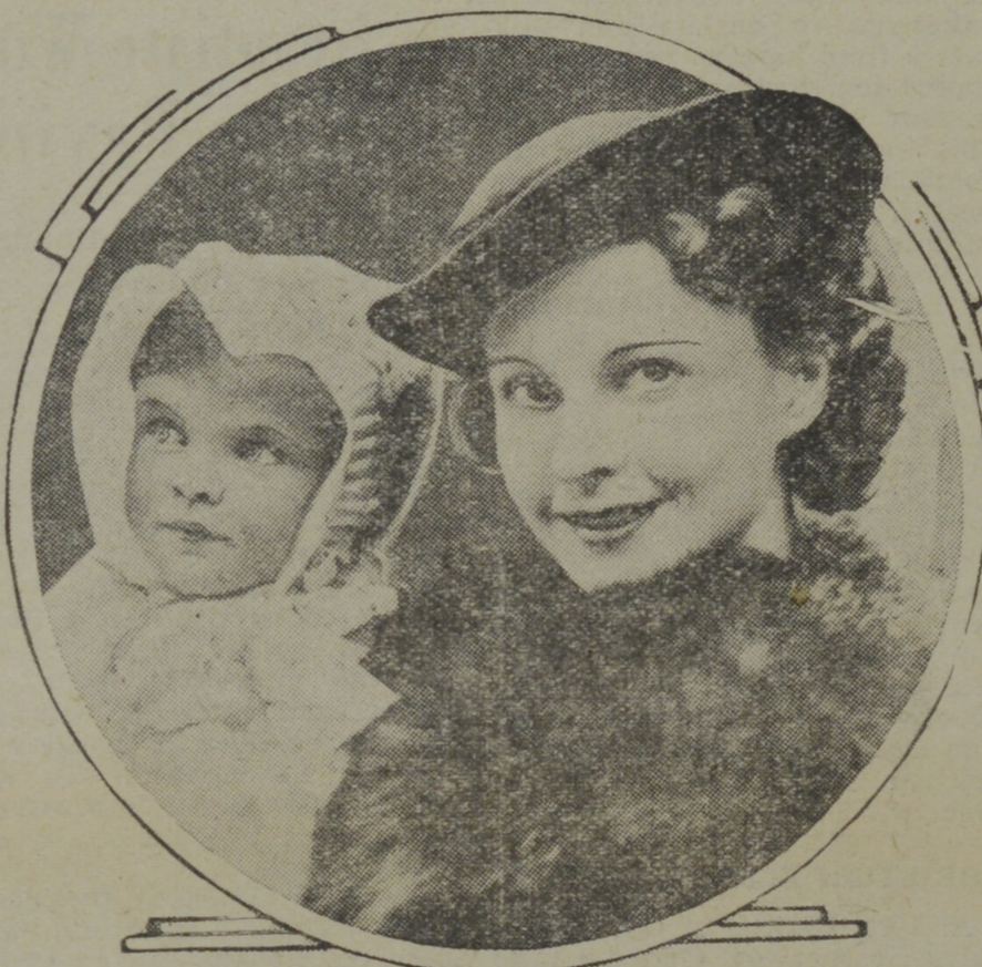
VIVIEN LEIGH, beautiful British actress, shown with her year-old-daughter, finds time from her maternal duties to devote to her stage career. Married at seventeen, she has attained both her family and success on the London stage at nineteen.

9,203 firms show 892,506 at work a gain of 17,457 compared with the preceding month. In the Maritimes 655 firms reported 69,417 employed, a gain of 1,217 over the preceding month. Improvements were noted in manufacturing, logging and mining, and construction, while workers were released in transportation and railway construction.