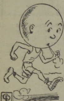
Uranus puts on spurts.