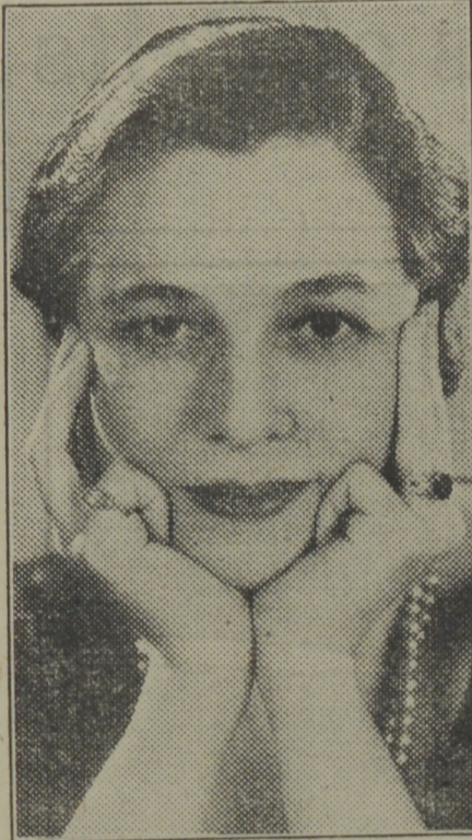
CORNELIA OTIS SKINNER

brings her famous character sketches to the air this summer every Sunday at 9.30 p.m., A.S.T., over WJZ, New York City.