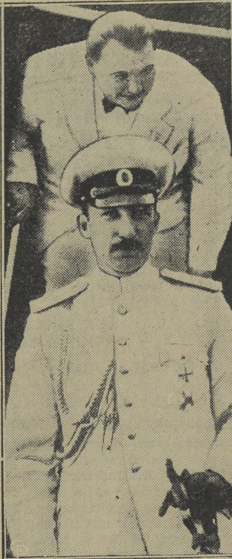
European chancelleries are attaching significance to the visit of HERMANN GOERING, German air minister, to KING BORIS in Sofia, where he showed him one of Germany's latest fighting aeroplanes. Bulgaria was Germany's ally in the late war.