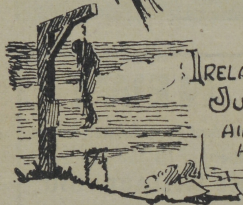
IRELAND'S FAMOUS JUDGE LYNCH HIMSELF HANGED HIS OWN SON.