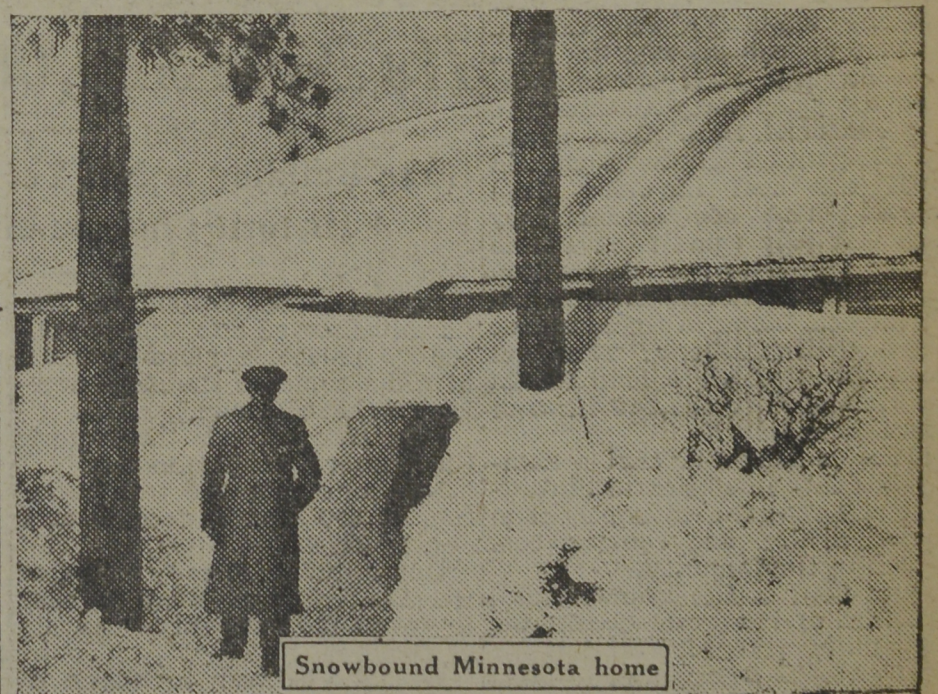
Snowbound Minnesota home

It is quite easy to imagine the surprised look which must have appeared on the face of the gentleman in the above picture when he first opened his front door after a recent blizzard. Half-an-hour's strenuous digging enabled him to make a new entrance, and although the snow was not labeled "Made in Canada" he is positive it was. This house is near Duluth, Minn.