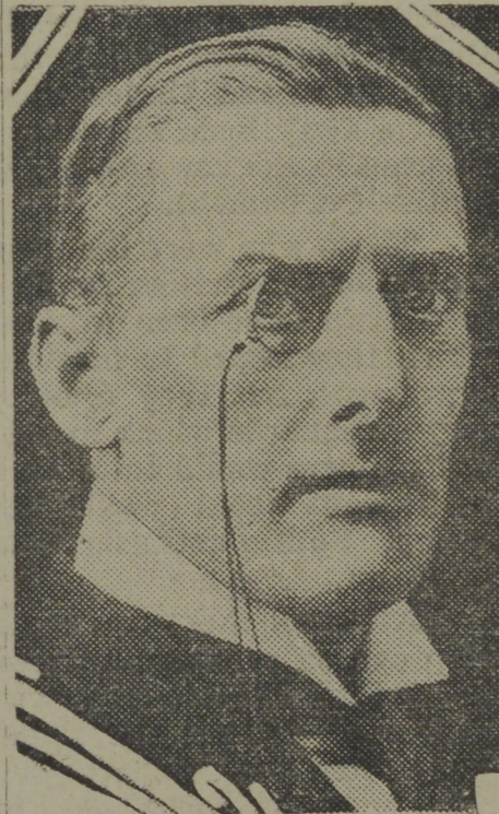
SIR AUSTEN CHAMBERLAIN, famous British statesman, who attacked Premier Baldwin during a debate in the House of Commons. He stated Mr. Baldwin should not be made head of the Committee for Imperial Defense, and drew attention to the Prime Minister's errors.