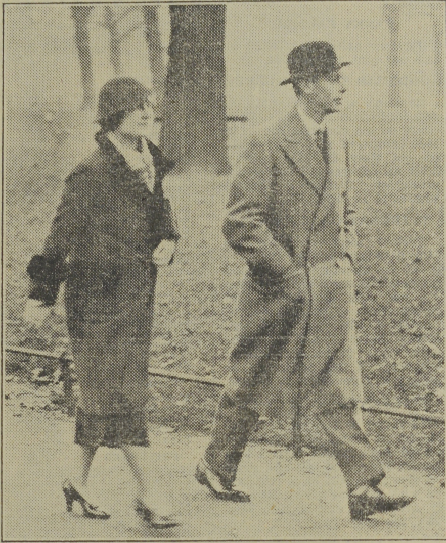
This picture was taken shortly before the death of the beloved monarch, King George V, cast gloom over the British Empire, and shows the DUKE and DUCHESS OF YORK enjoying an afternoon walk through Hyde Park, unattended or unrestricted with the attentions of detectives and police officers, as would be the case with royalty in most other countries. On this occasion, they are able to enjoy just as much privacy as any ordinary citizen.