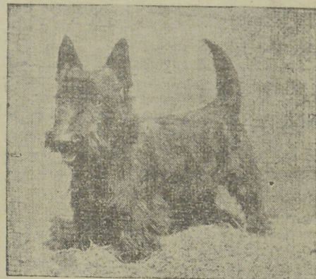
CH. HEATHER HIGHLANDER

Three of these sires are black, Cossar Revolt being brindle, also a proven sire. These braw Scots have plenty of "diehard" character, all alert, sound at both ends and siring excellent puppies. Heather Walter and Cossar Barty we recommend for shy bitches.