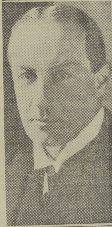
For several days rumors have been emanating from the British capital to the effect that PREMIER STANLEY BALDWIN (right) would be forced to resign owing to acute deafness. The same rumor intimated that NEVILLE CHAMBERLAIN, Chancellor of the Exchequer (left), would take over the reins of office. It has now been definitely announced that Mr. Baldwin will not be resigning the Premiership.

may deem necessary for the purpose of ascertaining the wages, hours or conditions prevailing in any trade and the fairness and adequacy thereof.