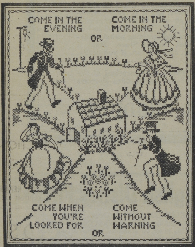
CROSS STITCH SAMPLER—PATTERN 1187

No matter what the season—a sampler is always fun to do, especially when it offers as colorful a picture, as quaint a verse as this. You will find it a grand way to use up scraps of cotton or silk floss, and a design that works up in no time, for the background is plain. Wouldn't it go beautifully in a young girl's room? Perchance that Young Miss will want to do this easy cross stitch design herself!