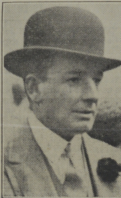
VISCOUNT BORODALE, eldest son of the late Earl Beatty, who succeeds to the title, following the death of his illustrious father.