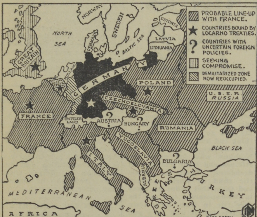
When Nazi troops marched into the Rhineland, occupying the sector demilitarized by the Versailles Treaty, the crisis produced an alignment of nations in support of France which created the military alliance of powers represented on the above map.