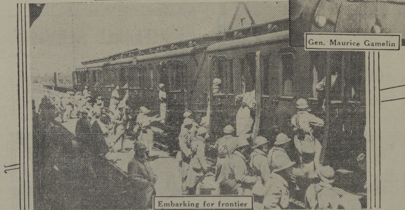
Embarking for frontier

When Adolf Hitler ordered 25,000 German troops into the demilitarized Rhine frontier section, thus violating the Versailles treaty and creating a new international crisis, France retaliated by mobilizing 150,000 soldiers in eastern fortifications. Some of the troops dispatched for the famous Maginot line several weeks ago at the first indication of the impending crisis are shown em-