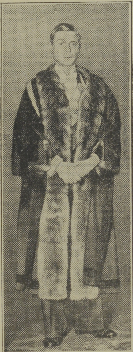
His Majesty KING EDWARD VIII. has been photographed in many roles, but the one above is one of the less familiar offices he holds. We see the King wearing the robes of Master of the Company of Stationers and Newspapermakers.