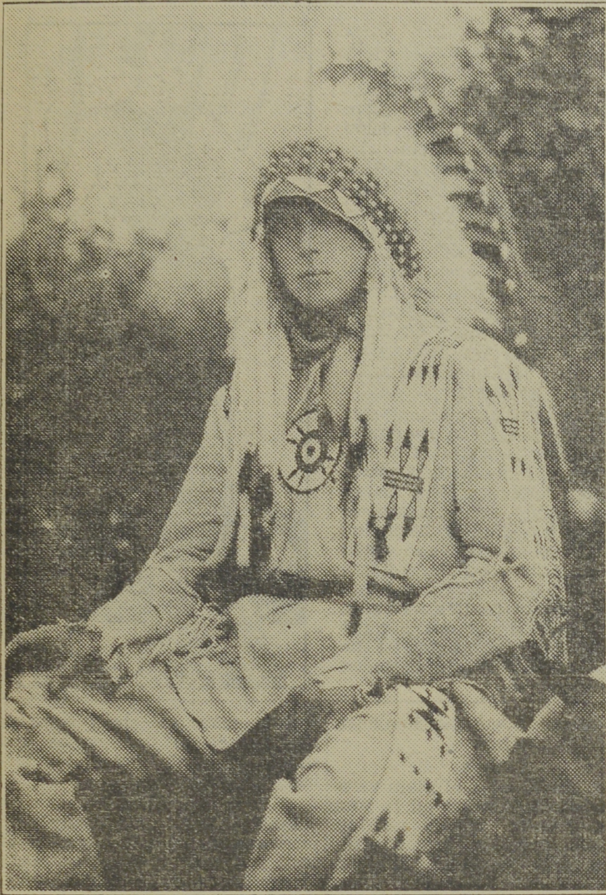
When KING EDWARD VIII made his first visit to Canada, when he was Prince of Wales, he paid a visit to the Stoney Indian Reserve, at Morley, Alberta. The enthusiastic Indians gave His Majesty the title of Chief Morning Star, and are very proud of their Chief. Here we see King Edward when he donned the ceremonial dress of the Stoney.