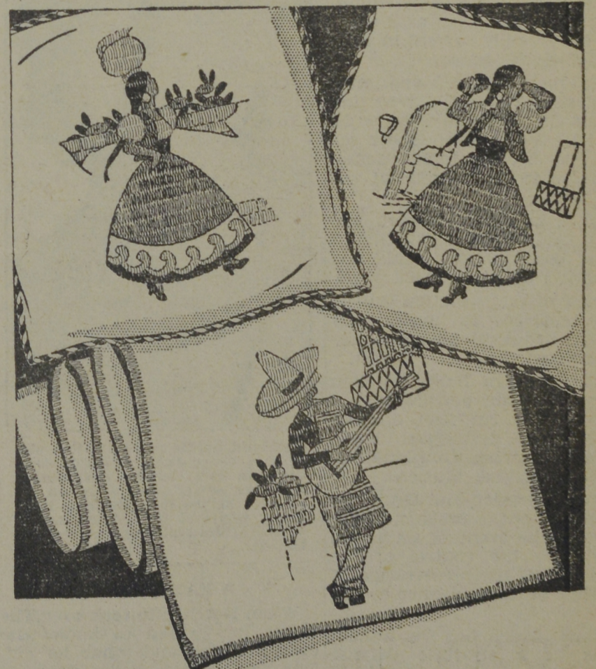
MEXICAN MOTIFS—PATTERN 1140

Color—romance—faint strains of a guitar! All are included in these lively Mexican motifs which Laura Wheeler suggests for livening up a winter-weary room, or for being foresighted about if you are planning porch furnishings. It's just the simplest sort of embroidery, using bought wools and an easy running stitch, and whether you use the designs for pillows, scarfs or whatever, they are sure to bring you a host of compliments.