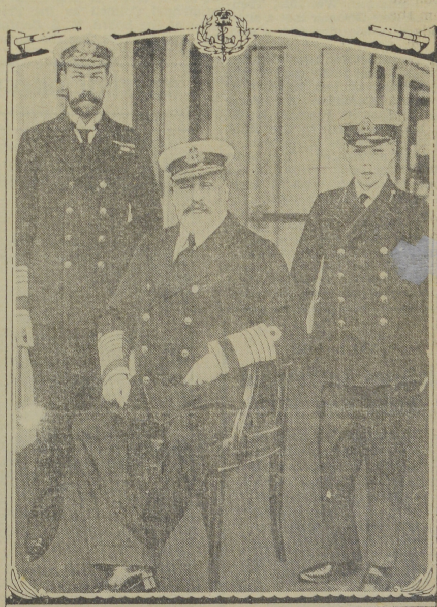
This picture shows the late KING EDWARD VII, the late KING GEORGE V, and the present KING EDWARD VIII. This was taken in 1909, when King Edward VII. seemed hale and hearty. Yet on May 9, 1910, he died suddenly of heart failure and his son, King George V., came to the Throne.