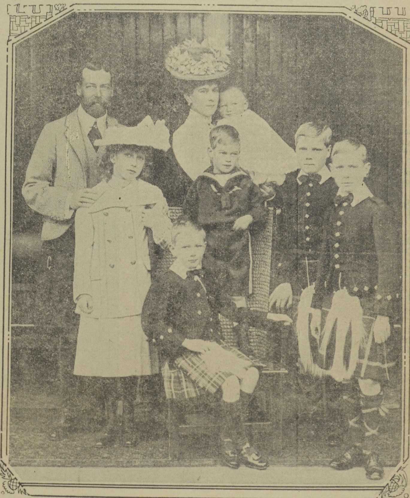
This interesting photograph of the late KING GEORGE AND HIS FAMILY was taken in 1906. The children are EDWARD, ALBERT, MARY, HENRY, GEORGE and JOHN. Just before this picture was taken in Scotland Prince John was born. He died in 1919. The late King was deeply concerned with his family and his chief delight was to be with his wife and children. All the members of the family had democratic ideas and they were constantly visiting the homes of working people and offering what assistance they could in the solving of their problems.