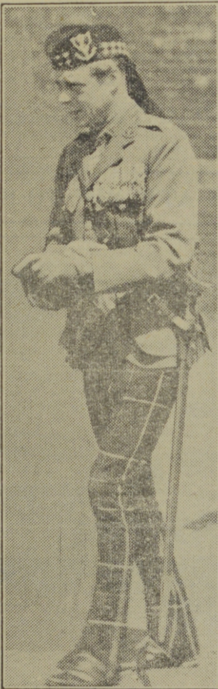
His Majesty KING EDWARD VIII, photographed in his uniform as Colonel-in-Chief of the Seaforth Highlanders. His Majesty, when Prince of Wales, took a deep interest in the Highland regiments and wore the Scottish uniform on many occasions.