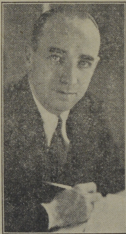
LENOX RILEY LOHR, the new president of the National Broadcasting Company.