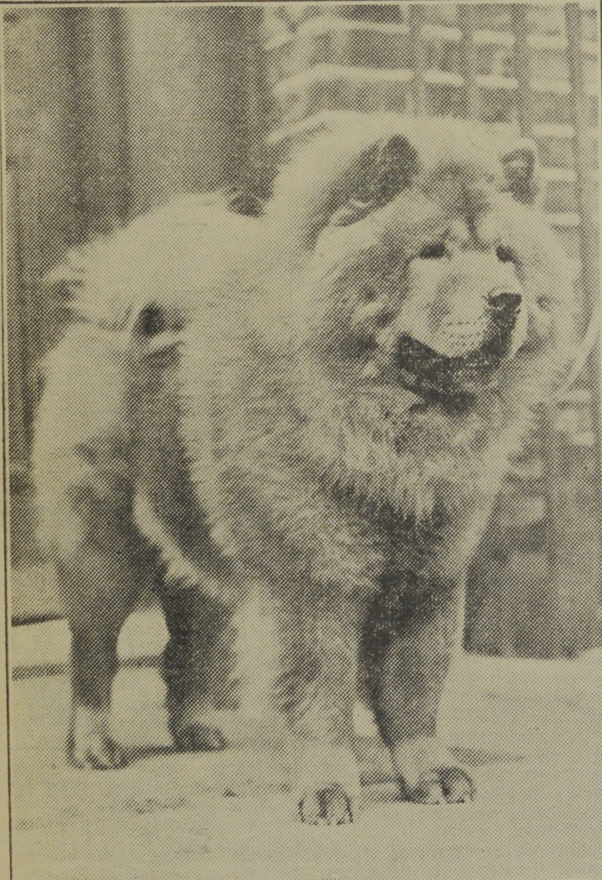
Chow Choh Ch. "Choonam Hung Kwong" is the proud animal named supreme champion of Cruft's famous dog show held in the Royal Agricultural Hall, London, England. This fine Chow won the coveted Crust's championship cup, six first prizes, champion and best Chow in the show. He has won twenty-four championships under nineteen different judges and is just two years old. The importance of his victories at Cruft's can be estimated from the fact that this famous dog show was celebrating its golden jubilee and had a record entry of 10,650 dogs.