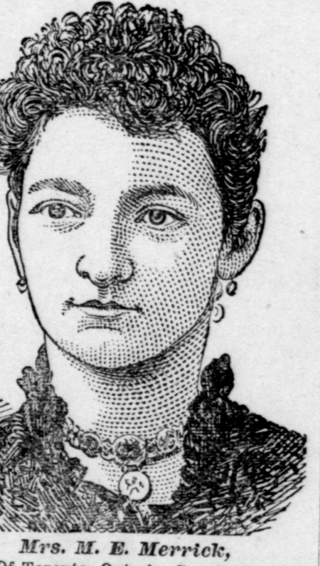
Of Toronto, Ontario, Cured of