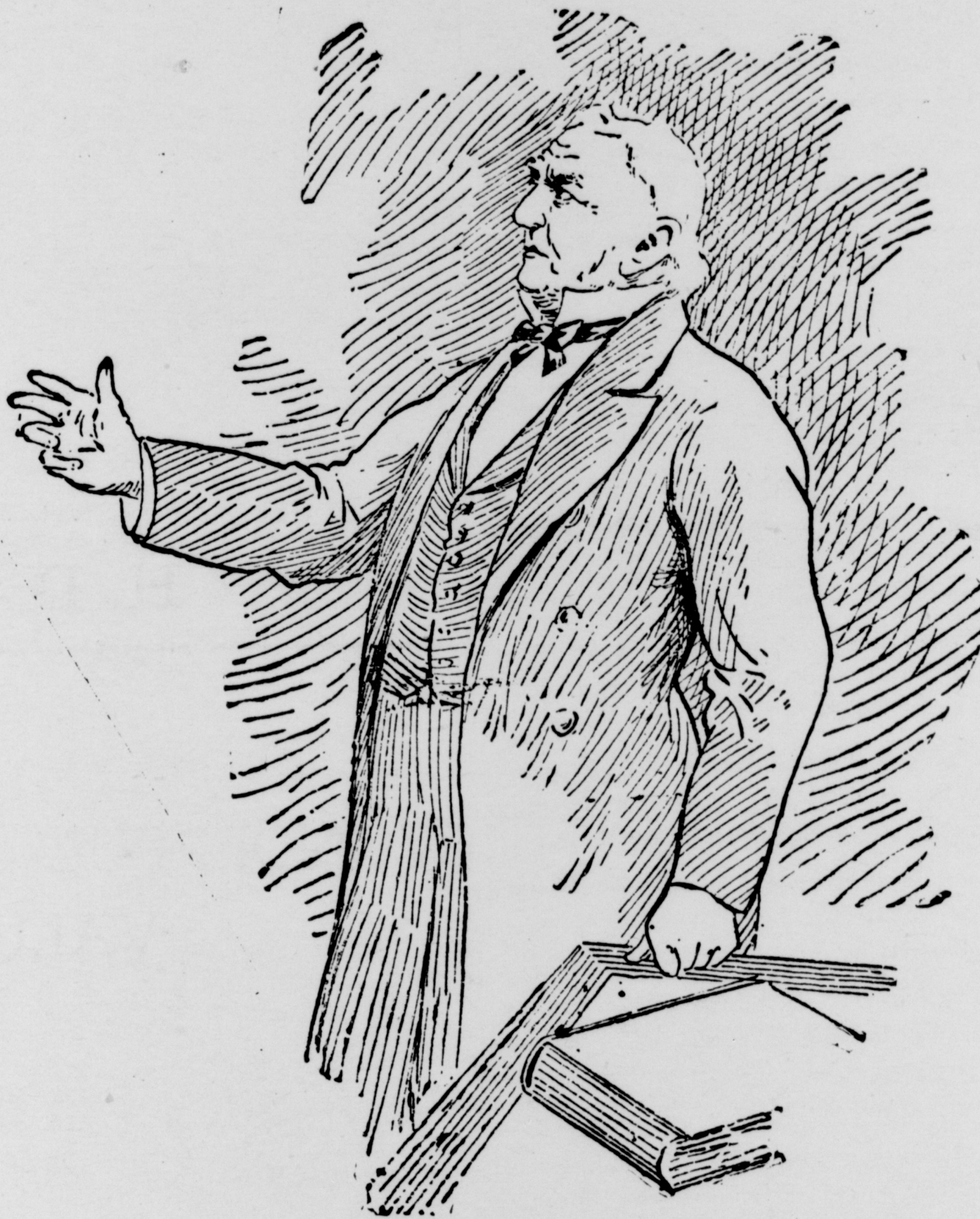
The Late Hon. W E Gladstone.

DON'T MISS THIS CHANCE ! Richardson, Porter & Co.