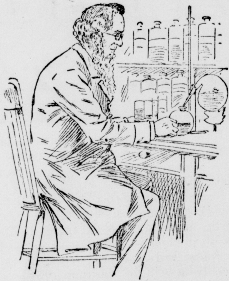
DR. A. W. CHASE EXPERIMENTING ON HIS REMEDIES.