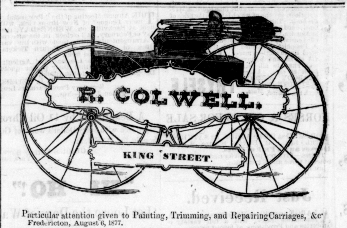
Particular attention given to Painting, Trimming, and Repairing Carriages, &c.