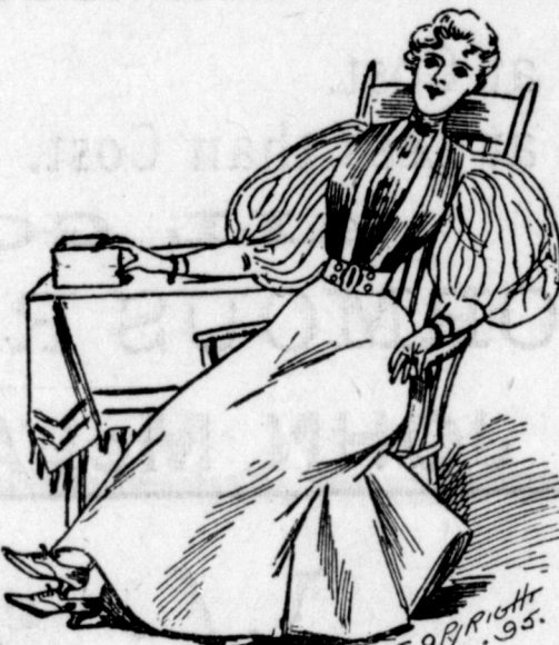
IT IS PROPER

to have Sterling Silver Belt Buckles, Silver Cuff Buttons, Silver Studs for the Shirt Waists, as well as Nice Rings, etc. Of course we have Plated Goods that look about as well, and you can take your choice of the great variety. Almost everybody knows that there is no class of Jewellery that we do not keep. Folks don't leave our store with disappointed faces.