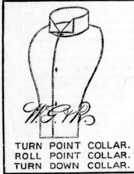
TURN POINT COLLAR. ROLL POINT COLLAR. TURN DOWN COLLAR.