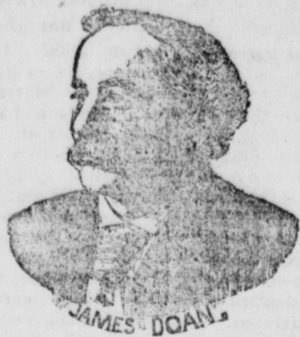
The Originator of