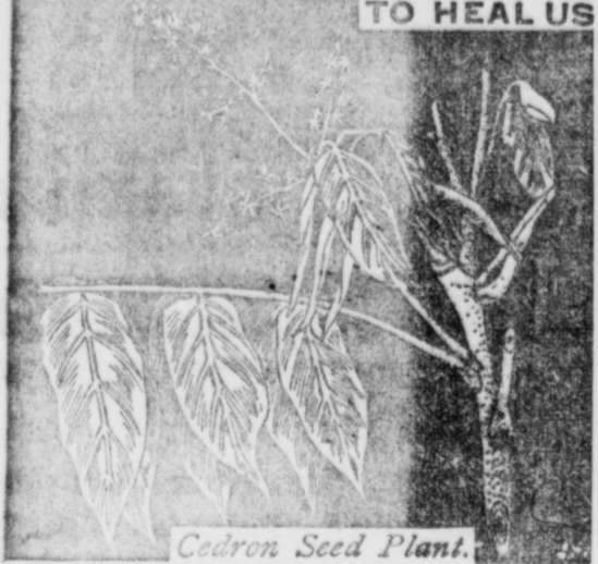
Cedron Seed Plant.

In Central America many natives are gathering the seeds of this plant, Cedron Seed, a rare medicine that has valuable curative powers. But few drug stores carry this seed, owing to the high cost of the article.