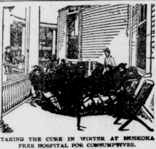
TAKING THE CURE IN WINTER AT MUSKOKA FREE HOSPITAL FOR CONSUMPTIVES.