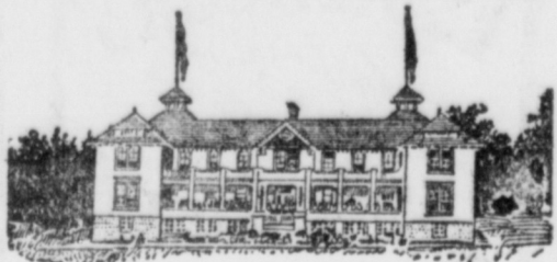
MUSKOKA FREE HOSPITAL FOR CONSUMPTIVES. MAIN BUILDING FOR PATIENTS.

THEN SEND YOUR CONTRIBUTIONS TO THE MUSKOKA FREE HOSPITAL FOR CONSUMPTIVES