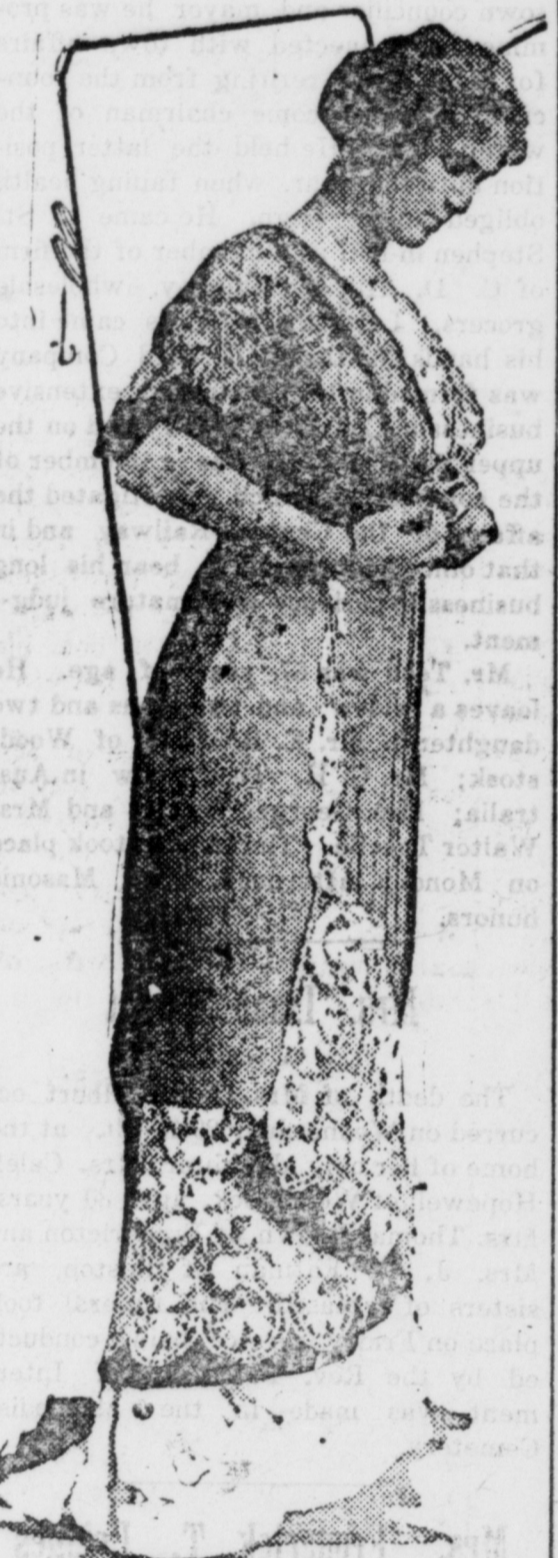
Heavy Macrim Lace combined effect- ively with sheer chiffon.

A still more effective dentifrice is prepared chalk and powderedorris root, and about a half teaspoonful of finely shaved Castile soap. This formula may be used a lifetime and never be improved upon, as it contains every essential for cleaning and whitening the teeth.