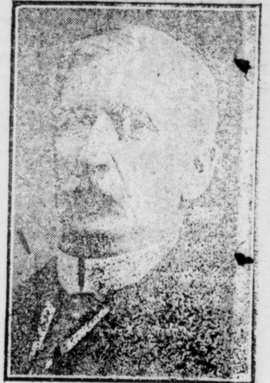
HON. FRANK COCHRANE, Minister of Railways and Canals.

procedure, and his previous two official visits to England will be of invaluable help to the new government.