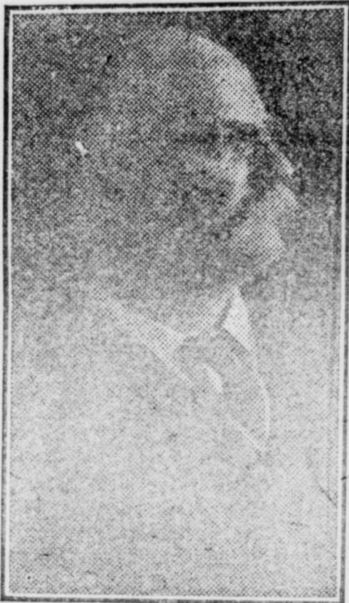
HON. C. J. DOHERTY, Minister of Justice.

In dealing with the personal of a government, most of the members of which are new to official life, the private characters and influence amongst their fellows will help considerably to judge the reasons of their inclusion in this really repre-