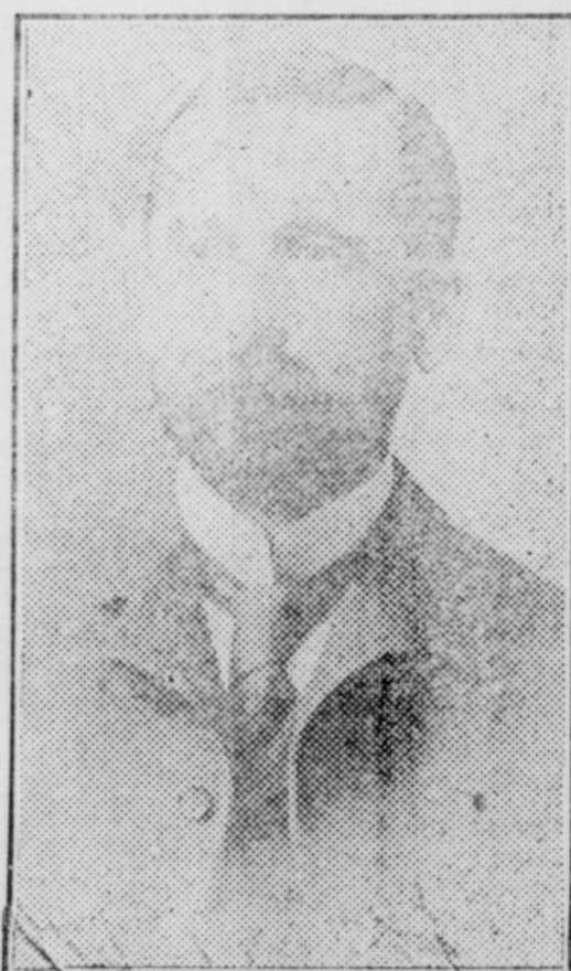
HON. GEORGE PERLEY, Minister without portfolio

representative Cabinet of Canada. When the task of leading his Majesty's loyal opposition fell to Mr. R. L. Borden in 1901 the Conservative party was weak in numbers and there was jealousy within the ranks — and to make matters worse even his friends had little confidence in this quiet lawyer from Nova Scotia to ultimately lead his party to victory. They did not know the man. He gave up his law practice which was considerable, and gradually gathered around him young men — each a born fighter and of irreproachable character both in public and private life — and instilled into them something