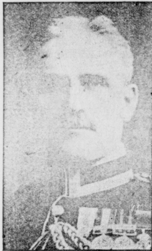
HON. SAM HUGHES, Minister of Militia.

process of elimination. Further, it is an unwritten law in the Dominion that every Province shall be represented as well as the two races and two great religions, so that while it would be possible to have chosen better individually, on the whole the cabinet chosen by Premier Borden to help him in the governing of this great country is worthy not only of