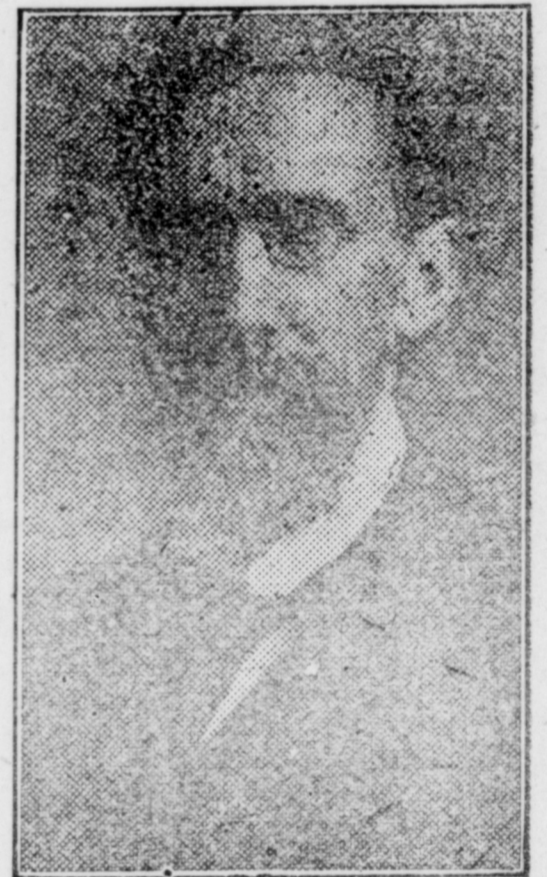
HON. GEO. E. FOSTER, Minister of Trade and Commerce.