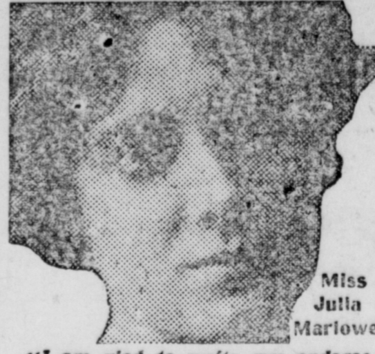
Miss Julia Marlowe

"I am glad to write my endorsement of the great remedy, Peruna. I do so most heartily."—Julia Marlowe.