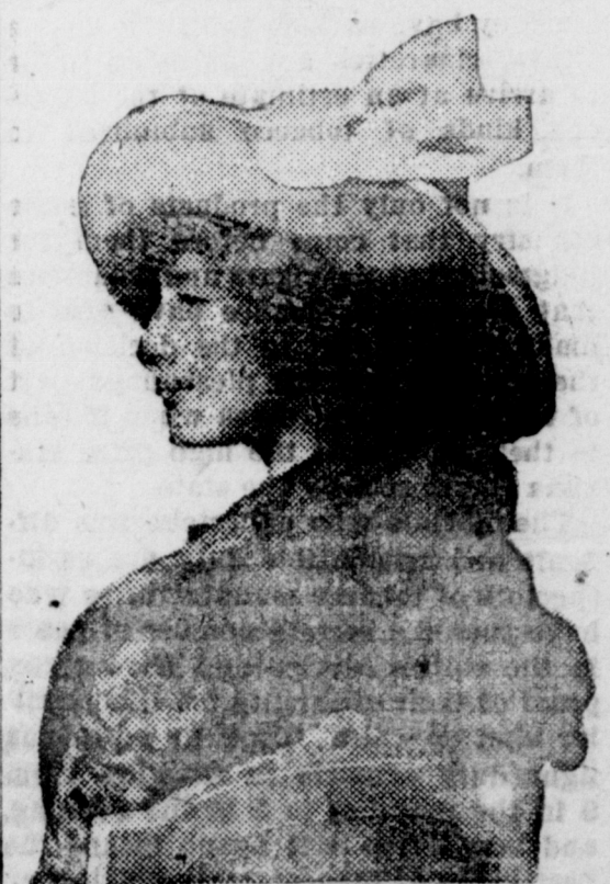
A DASHING HAT FOR FALL.

Use of "Mountain Peak" Braid. Braid is much used on the new hats and used not in plain bands or bind-